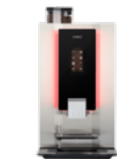
OPTIBEAN 3 (XL) TOUCH