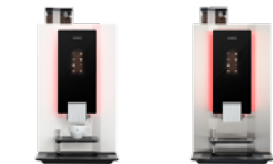
OPTIBEAN 2 (XL) TOUCH