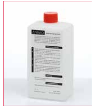
Animo cleaning product

Heating beverages properly takes care and attention. Every kitchen professional knows that. Milk and hot chocolate are especially sensitive to rapid or irregular heating. Luckily, you can leave it all to Animo!