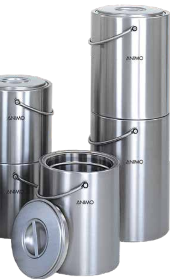
Insulated food containers MVC (left) and VC (right)