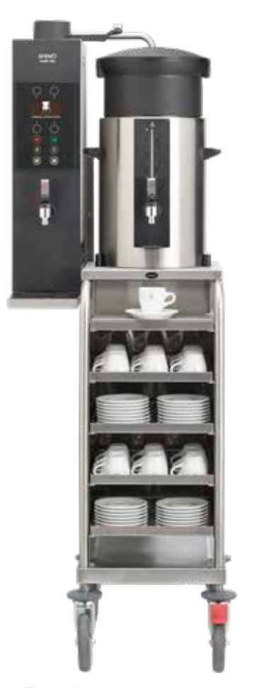
+ Type - JR (Type ST is suitable for large containers)