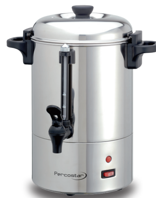
3 L - 9010403