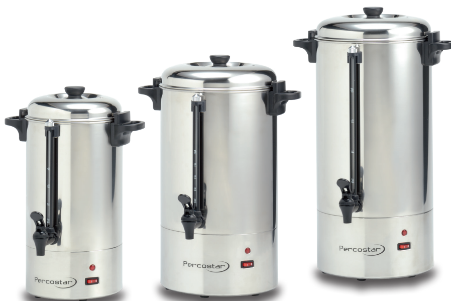
6,5 L - 9010407

The equipment, which is completely made of stainless steel, has a well-formed polished exterior and is supplied with a modern designed tap with sight glass.